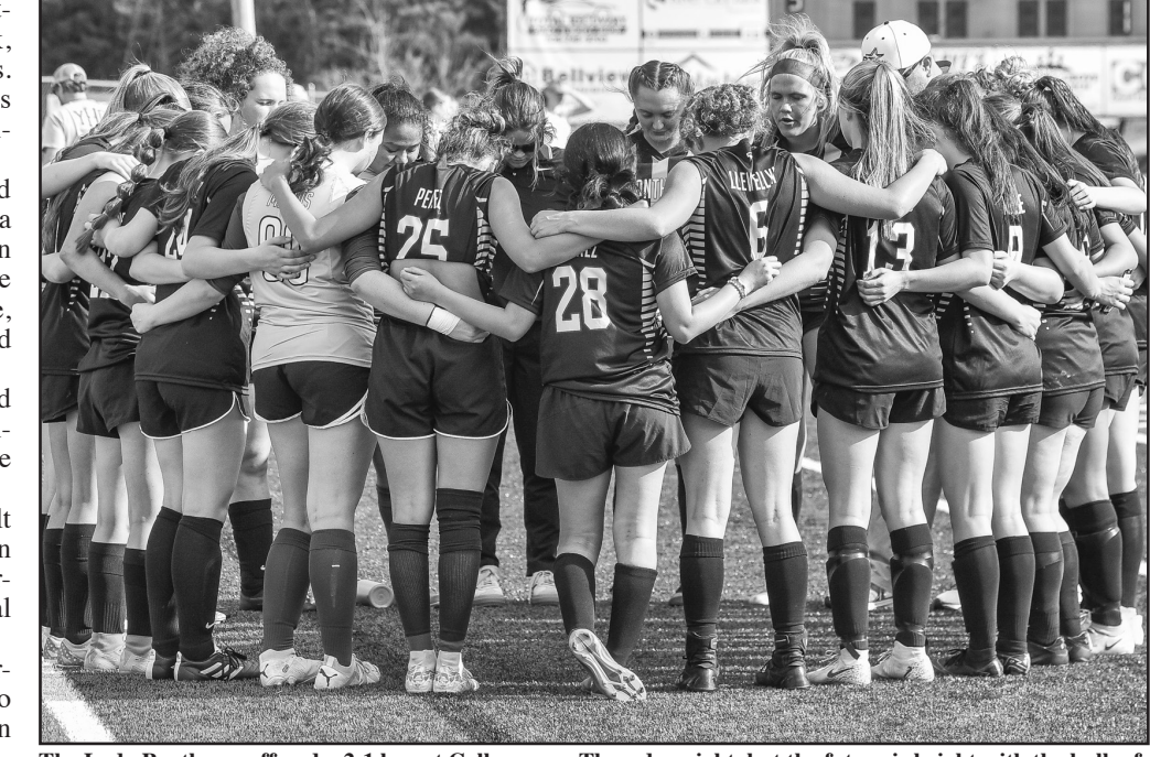
The Lady Panthers suffered a 2-1 loss at Callaway on Thursday night, but the future is bright with the bulk of the roster made up of freshmen and sophomores.