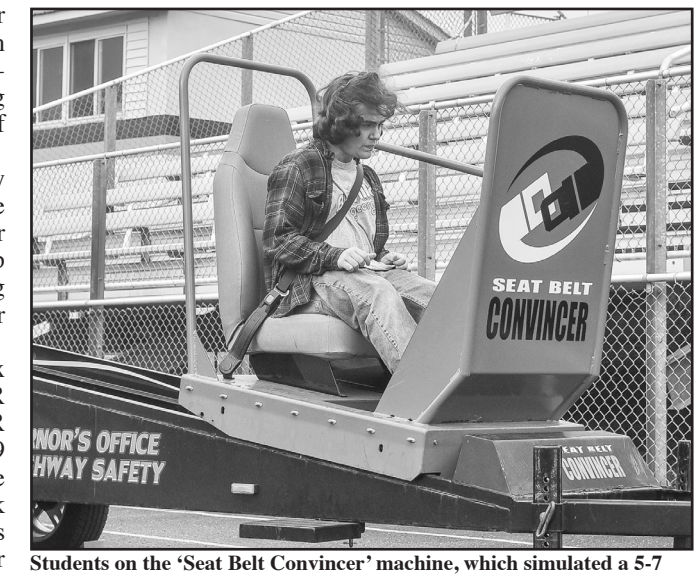
mph crash.