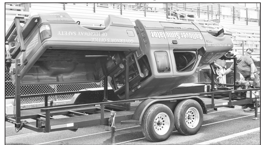
The Rollover Simualtor demonstrates what happens when a vehichle flips.